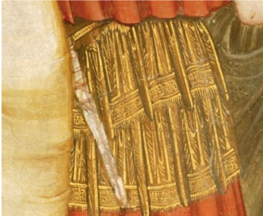
Fig. 30. Giotto di Bondone, Scenes from the New Testament , detail of the Kiss of Judas , c. 1315-20. Fresco and gold leaf. Upper Church of the Basilica San Francesco, Assisi.