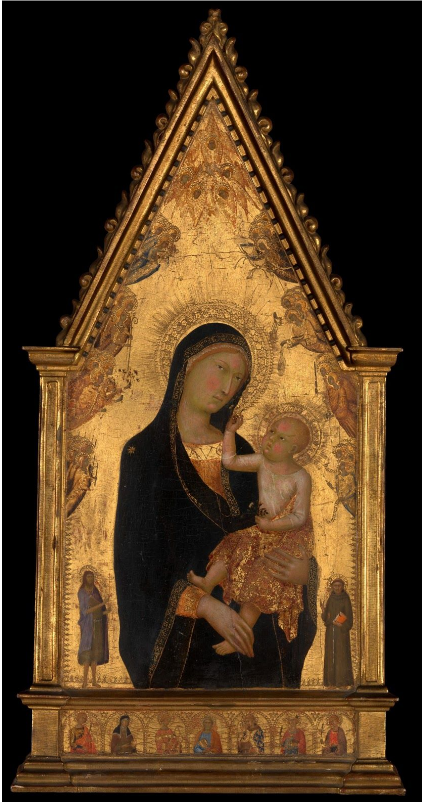
Fig. 1. Lippo Memmi, Madonna and Child with Saints and Angels , c. 1350. Tempera and gold leaf on panel. 26 ¼ x 13 in. The Metropolitan Museum of Art, New York.