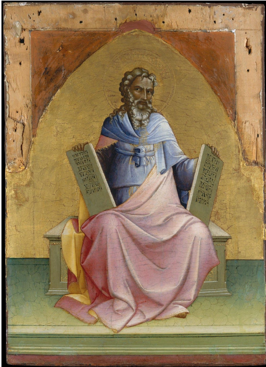
Fig. 15. Lorenzo Monaco, Moses , c. 1408-10. Tempera and gold on wood. 24 1/2 x 17 1/2 in. The Metropolitan Museum of Art, New York.