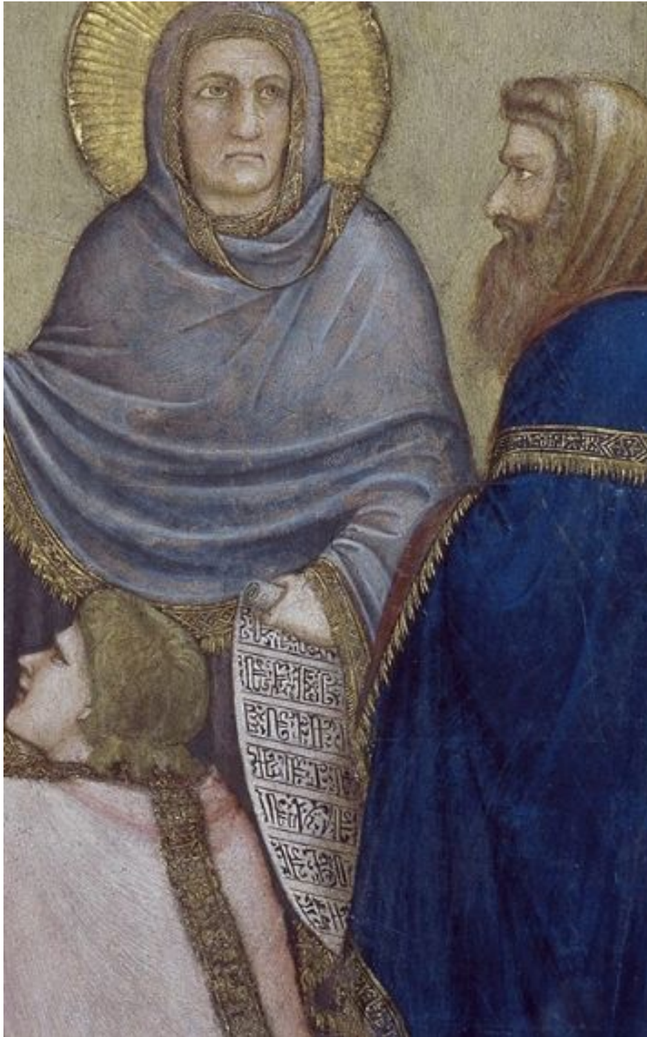
Fig. 20. Giotto di Bondone, Scenes from the New Testament , detail of the Presentation at the Temple , c. 1315-20. Fresco and gold leaf. Upper Church of the Basilica San Francesco, Assisi.