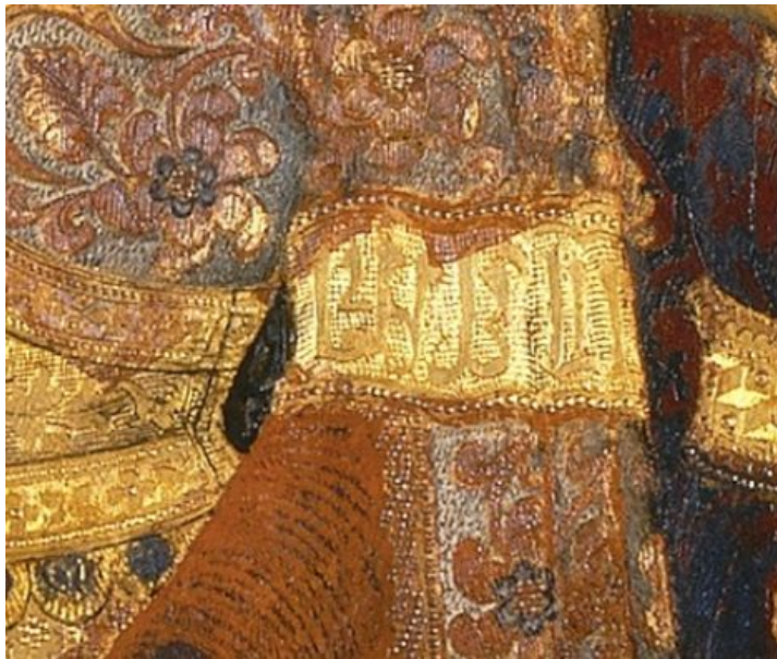
Fig. 11. Gentile da Fabriano, Adoration of the Magi , detail of the inscription of the Magus's garment.