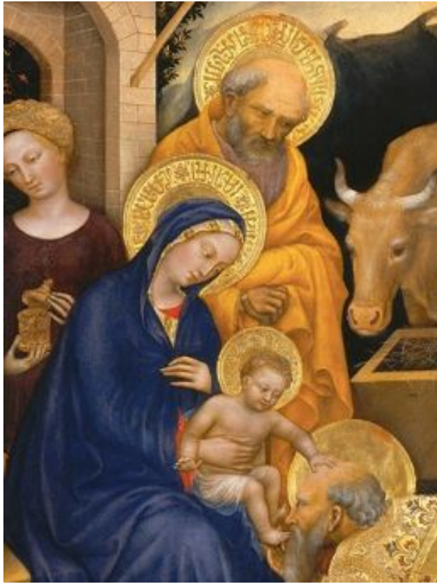
Fig. 13. Gentile da Fabriano, Adoration of the Magi , detail of the Holy Family.