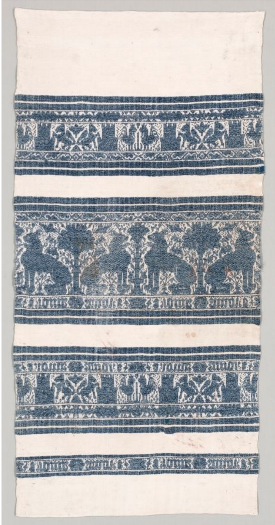
Fig. 23. Towel , c. 1500, Perugia, Italy. Cotton, 42 1/2 x 20 1/2 in. The Cleveland Museum of Art, Cleveland.