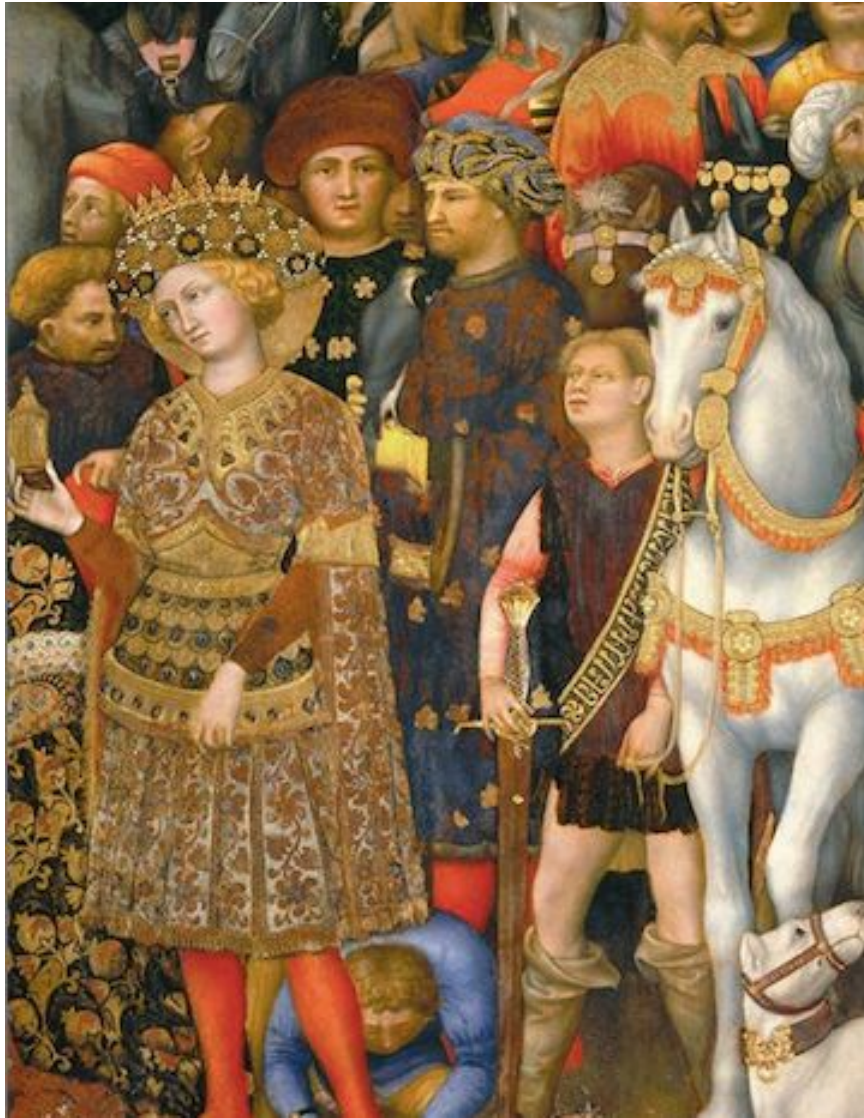
Fig. 32. Gentile da Fabriano, Adoration of the Magi , detail of Palla and Onofrio Strozzi.