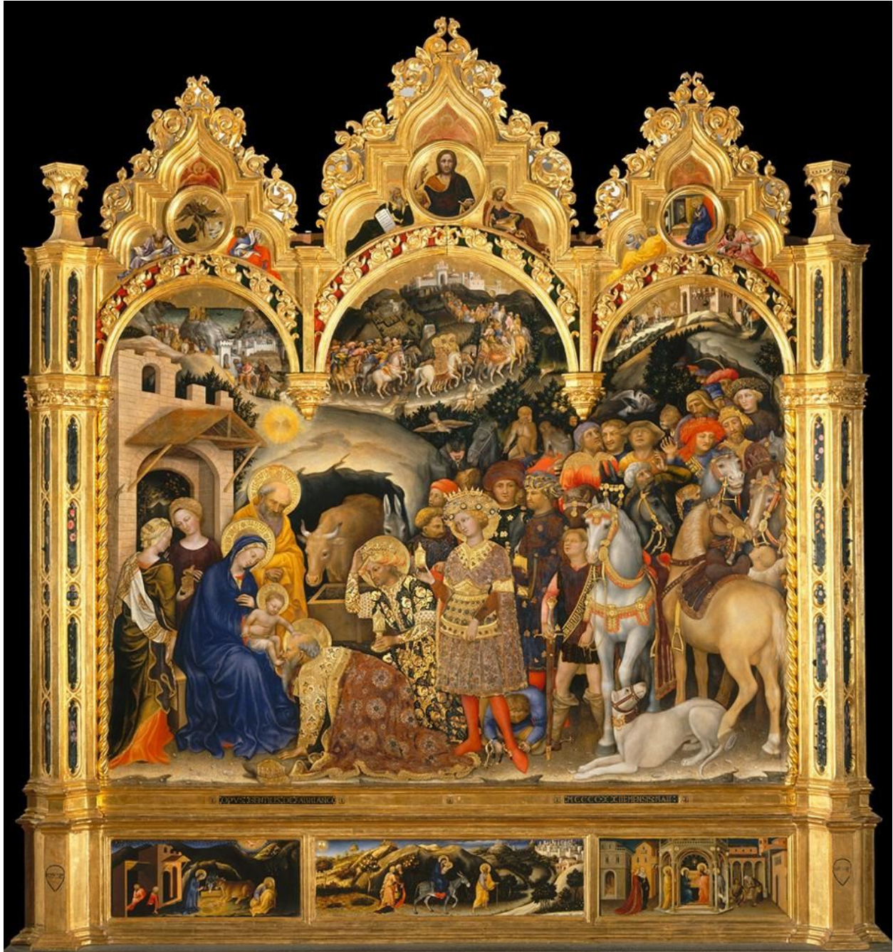
Fig. 2. Gentile da Fabriano, Adoration of the Magi , 1423. Tempera and gold leaf on wood. 120 in × 111 in. The Uffizi Gallery, Florence.