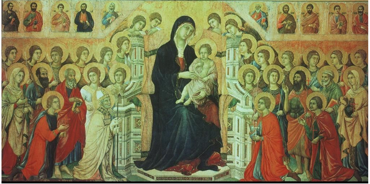
Fig. 27. Duccio di Buoninsegna, Maestà , 1308. Tempera and gold on wood, 84 in × 156 in. Museo dell'Opera Metropolitana del Duomo, Siena.