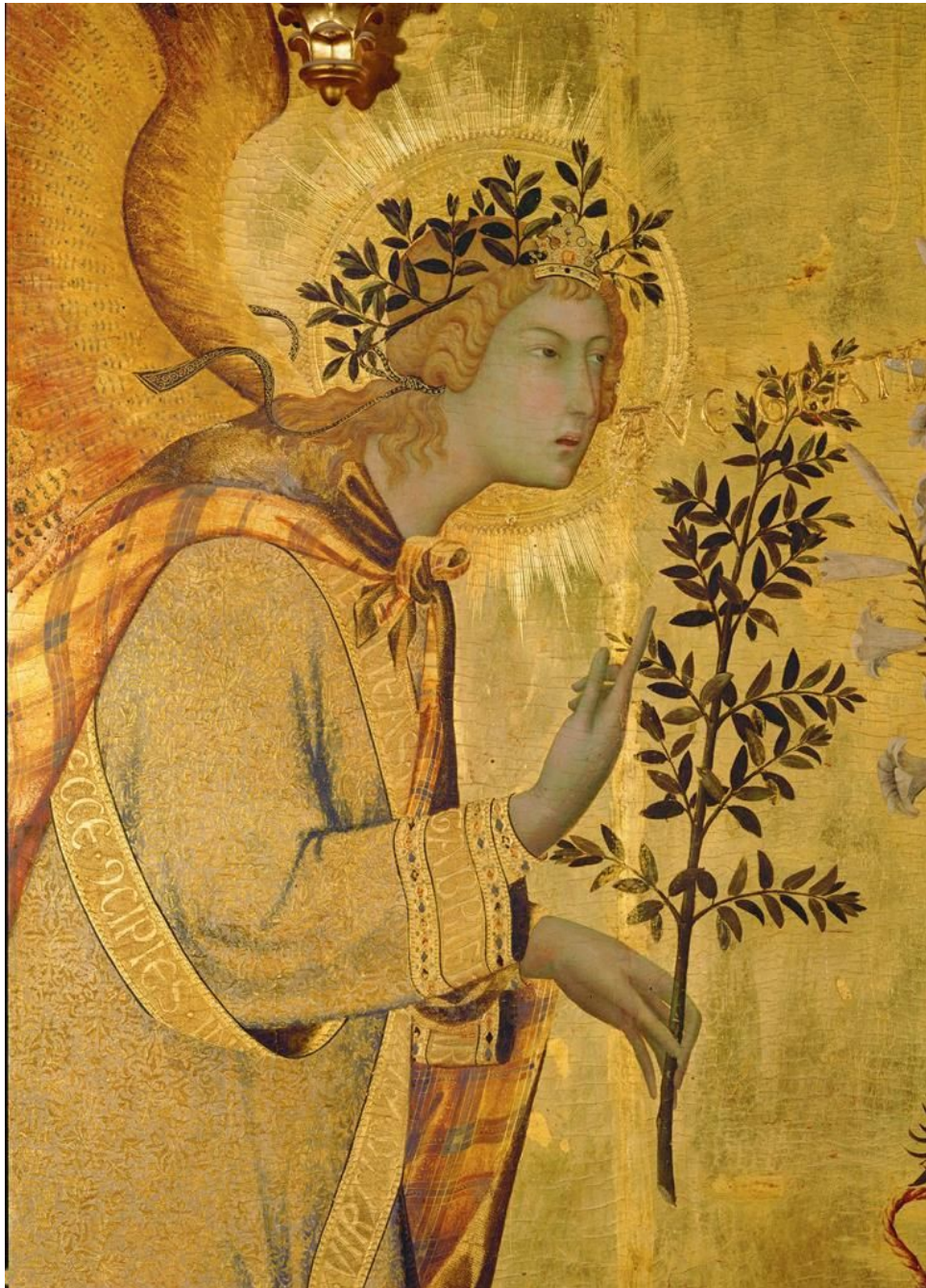
Fig. 17. Simone Martini and Lippo Memmi, Annunciation with St. Margaret and St. Ansanus , detail of Archangel Gabriel.