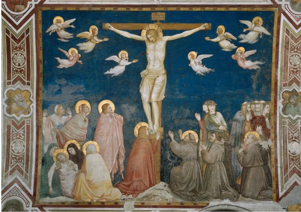
Fig. 29. Giotto di Bondone, Scenes from the New Testament , detail of the Crucifixion , c. 1315-20. Fresco and gold leaf. Upper Church of the Basilica San Francesco, Assisi.