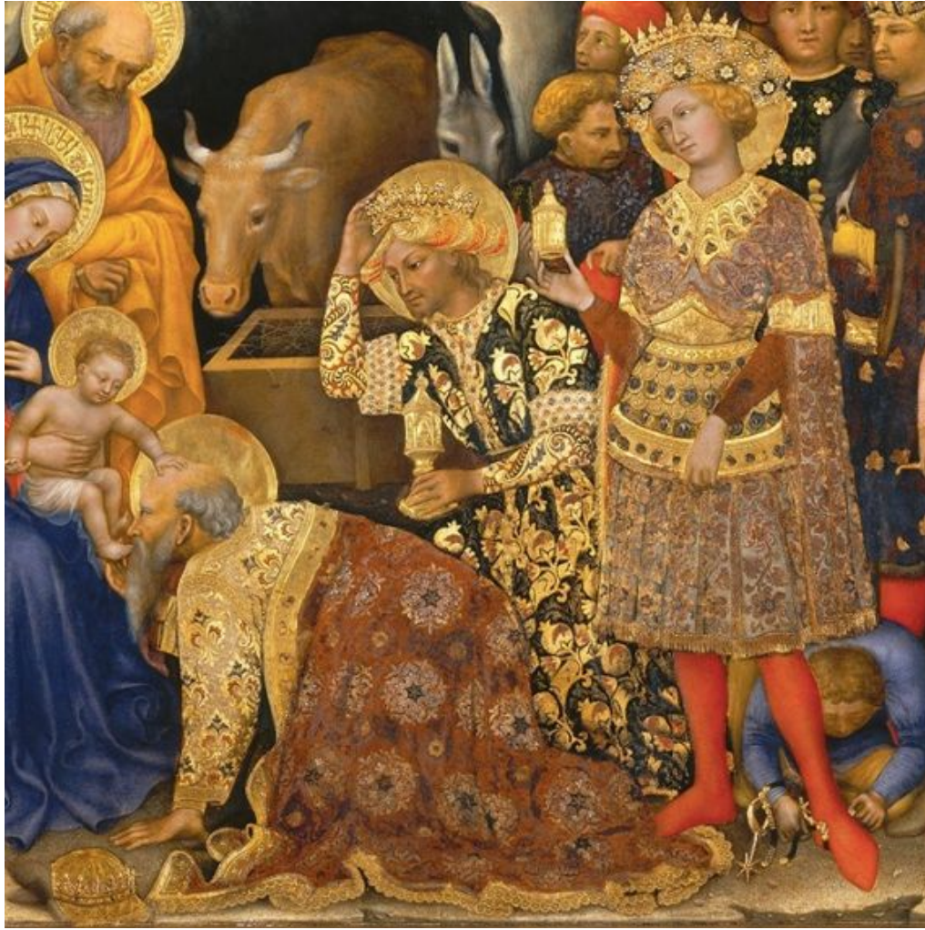
Fig. 10. Gentile da Fabriano, Adoration of the Magi , detail of the Magi.