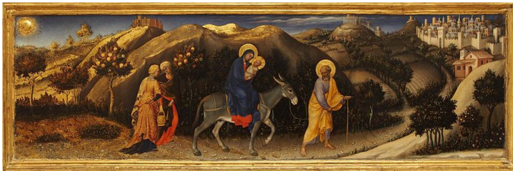
Fig. 5. Gentile da Fabriano, Adoration of the Magi , detail of the predella scene Flight into Egypt .