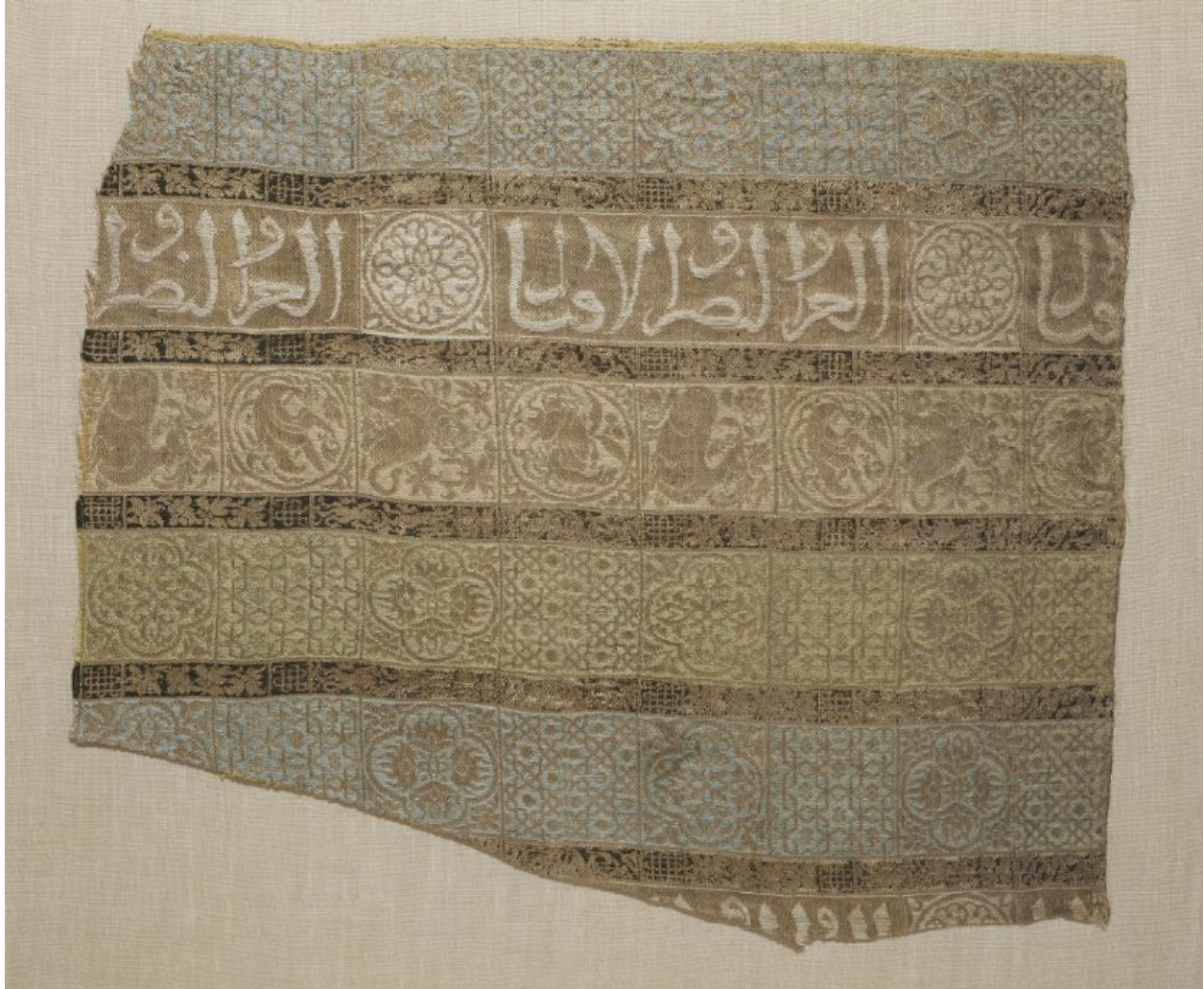
Fig. 24 Woven textile , c. 1300-50, Central Asia. Pattern woven silk with gold gilded tanned leather, 23 ¼ x 21 in. The Victoria and Albert Museum, London.