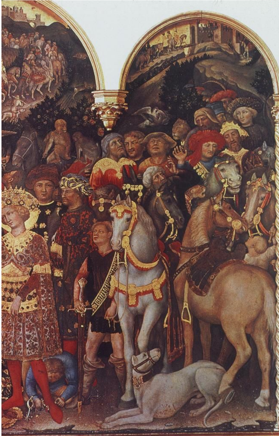
Fig. 8. Gentile da Fabriano, Adoration of the Magi , detail of the procession.