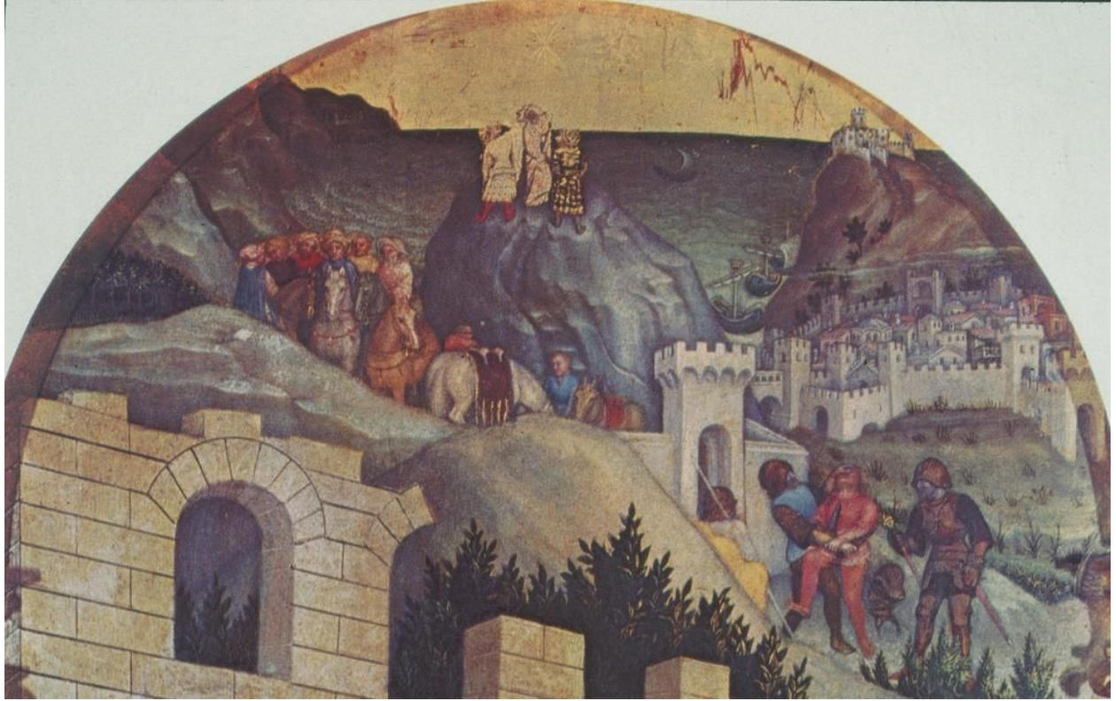
Fig. 7. Gentile da Fabriano, Adoration of the Magi , detail of the left lunette, Magi observing the star.