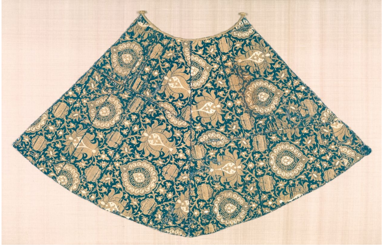
Fig. 25. Mantle for a statue of the Virgin with lotus blossoms and medallions , c. 1430, Spain, Nasrid period. Silk and gilt-metal thread, 27 3/4 x 43 3/4 in. The Cleveland Museum of Art, Cleveland.