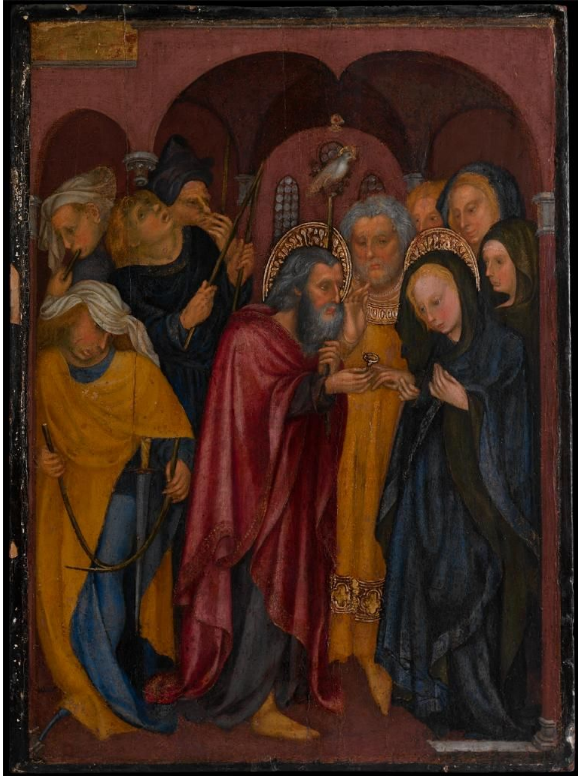
Fig. 22. Michelino da Besozzo, Marriage of the Virgin , c. 1435. Tempera on panel, 25.6 in × 18.7 in. The Metropolitan Museum of Art, New York.