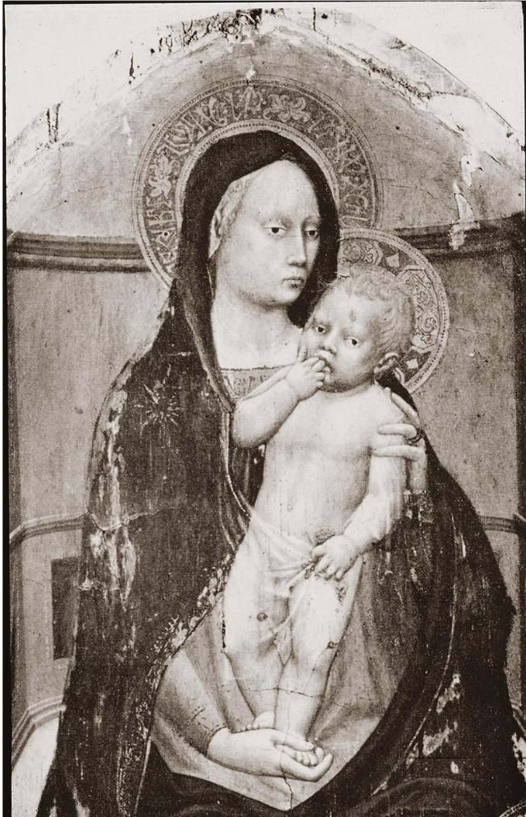
Fig. 21. Masaccio, San Giovenale Triptych , detail of the Madonna and Child, 1422. Tempera and gold on panel. Museo Masaccio, Florence.