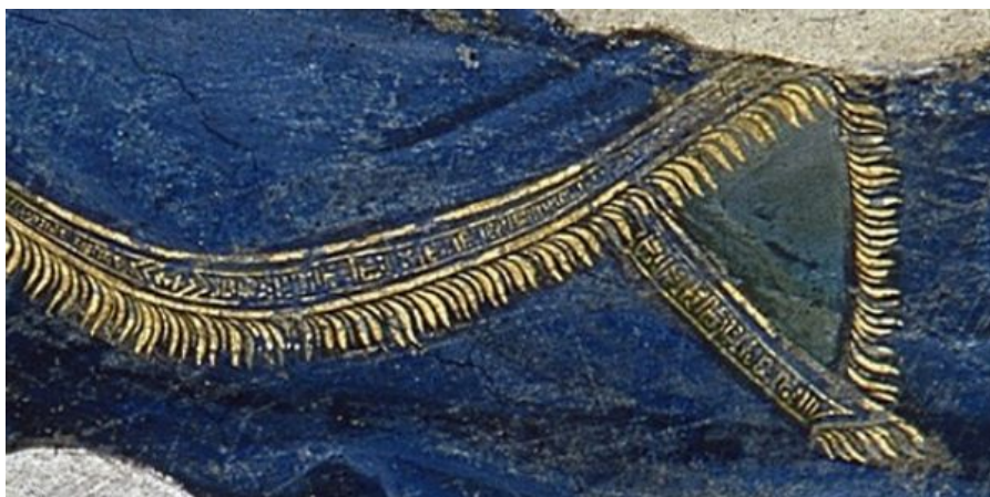
Fig. 19. Giotto di Bondone, Scenes from the New Testament , detail of the Nativity , c. 1315-20. Fresco and gold leaf. Upper Church of the Basilica San Francesco, Assisi.