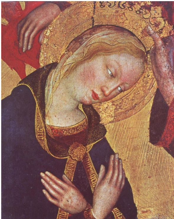
Fig. 14. Gentile da Fabriano, Valle Romita Polyptych , c. 1410-12. Tempera and gold on panel. 110 in × 98 in. Pinacoteca di Brera, Milan.