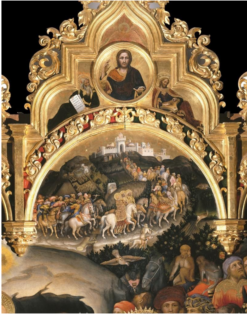
Fig. 3. Gentile da Fabriano, Adoration of the Magi , detail of frame and journey to Bethlehem.