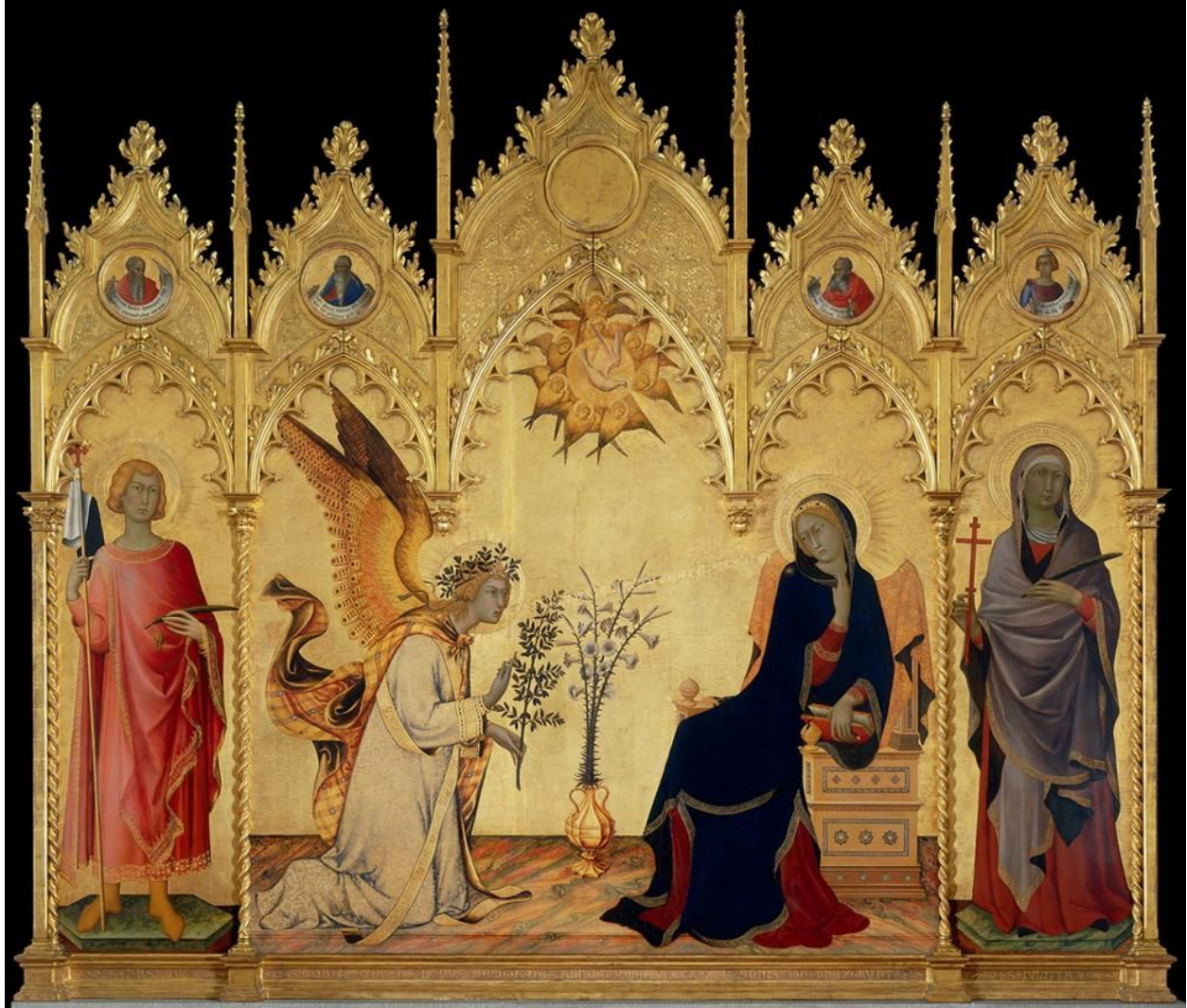
Fig. 16. Simone Martini and Lippo Memmi, Annunciation with St. Margaret and St. Ansanus , 1333. Tempera and gold on panel. 120 in × 104 in. Uffizi Gallery, Florence.