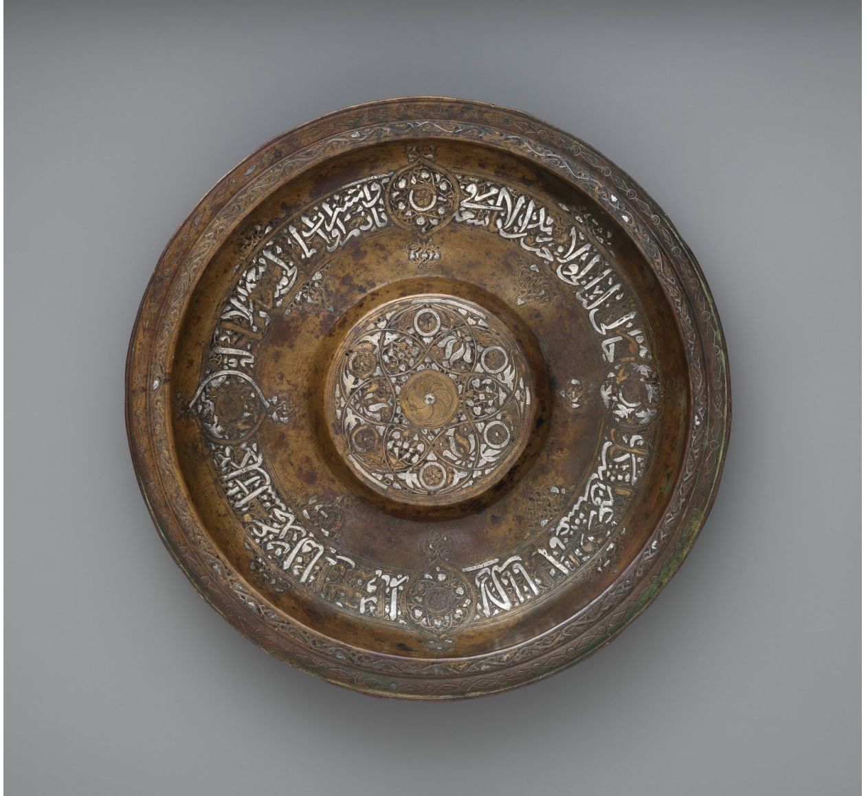
Fig. 28. Mamluk Philae Dish , c. 1345-60, Egypt or Syria, Mamluk period. Brass inlaid with silver and gold, 1.5 x 11.4 in (diameter). The Metropolitan Museum of Art, New York.