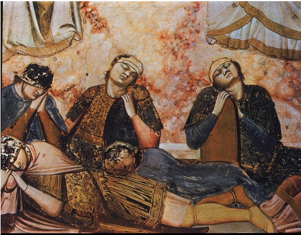
Fig. 31. Giotto di Bondone, Scenes from the New Testament , detail of the Resurrection , c. 1315-20. Fresco and gold leaf. Upper Church of the Basilica San Francesco, Assisi.