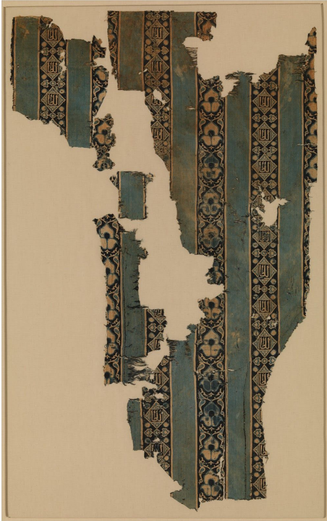
Fig. 26. Textile fragment, c. 1500, Egypt, Mamluk period. Silk, 24 x 14 3/4 in. The Metropolitan Museum of Art, New York.