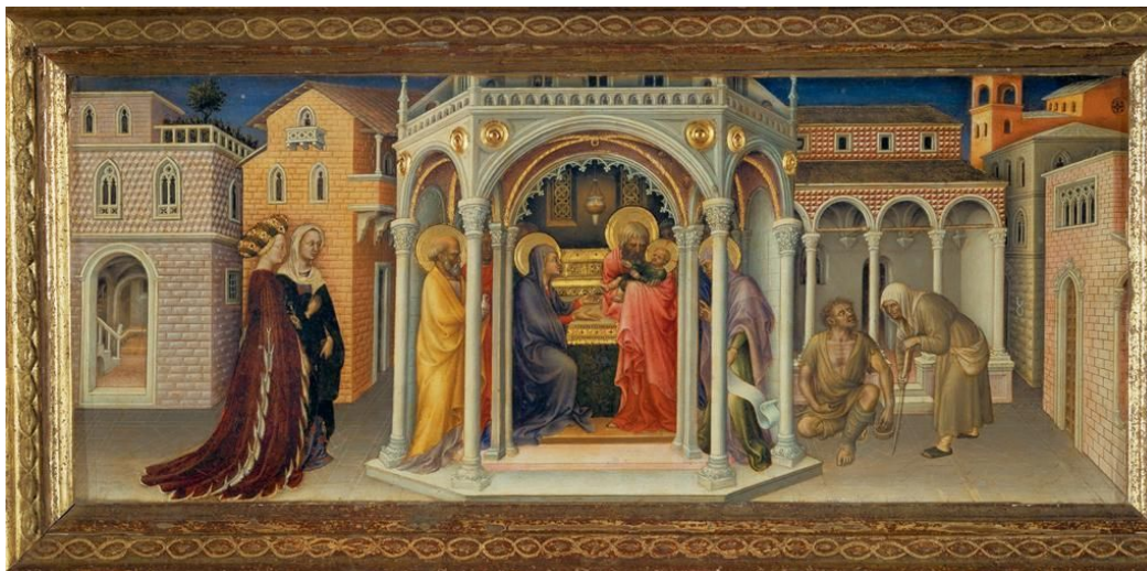
Fig. 6. Gentile da Fabriano, Adoration of the Magi , detail of the predella scene the Presentation at the Temple .