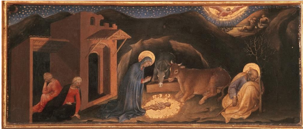
Fig. 4. Gentile da Fabriano, Adoration of the Magi , detail of predella scene the Nativity .