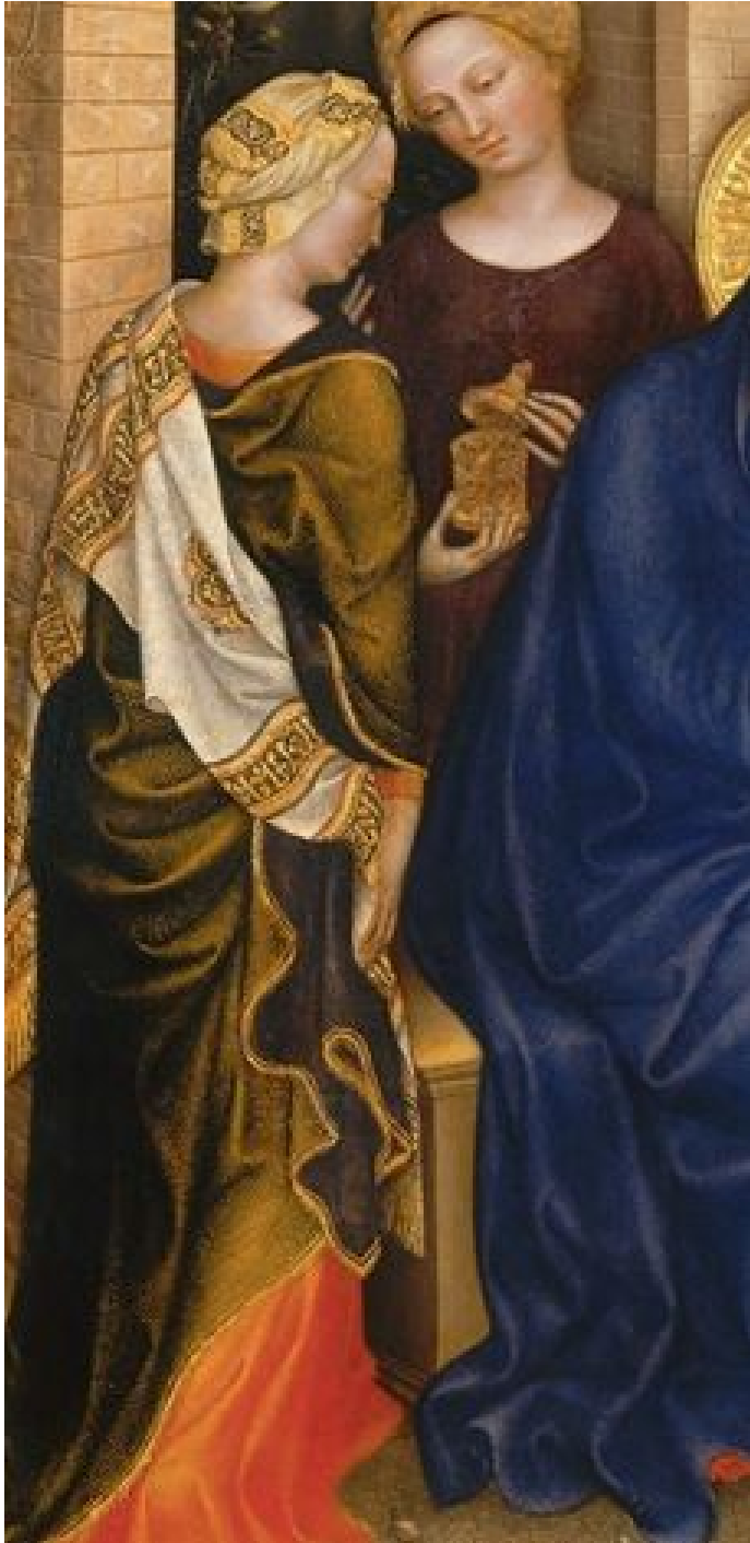
Fig. 9. Gentile da Fabriano, Adoration of the Magi , detail of the woman wearing a pseudo-inscribed mantle.