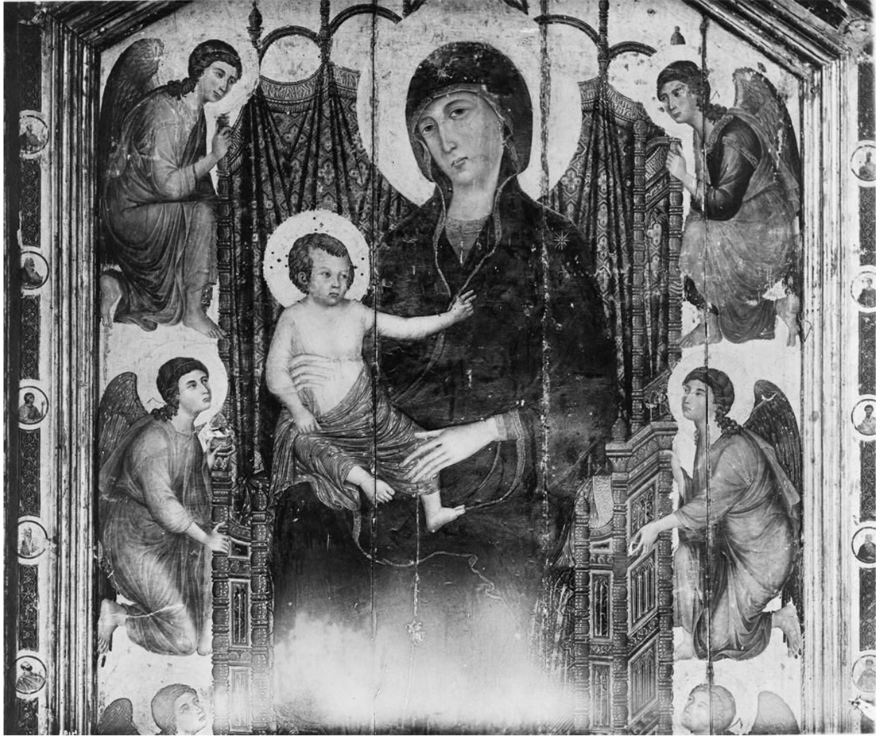
Fig. 18. Duccio di Buoninsegna, Rucellai Madonna , c. 1285. Tempera and gold on panel. 180 in × 110 in. Uffizi Gallery, Florence.